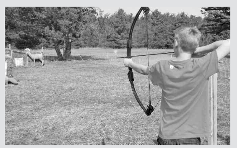
A Youth Day will be held at the Charlevoix Rod and Gun Club this Saturday, May 6, from 10am to 4pm (rain or shine).

Fish Provided by the Jordan River National Fish Hatchery. The Charlevoix Rod and Gun Club is located at 11330 US 31 Highway North, Charlevoix. If you have